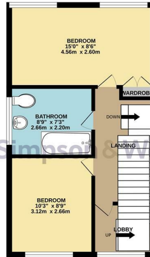
1ST FLOOR 389 sq.ft. (36.1 sq.m.) approx.