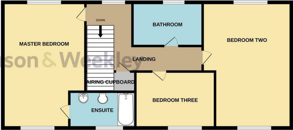
TOTAL FLOOR AREA : 1656 sq.ft. (153.9 sq.m.) approx.

Whilst every attempt has been made to ensure the accuracy of the floorplan contained here, measurements of doors, windows, rooms and any other items are approximate and no responsibility is taken for any error, omission or mis-statement. This plan is for illustrative purposes only and should be used as such by any prospective purchaser. The services, systems and appliances shown have not been tested and no guarantee as to their operability or efficiency can be given. Made with Metropix ©2025