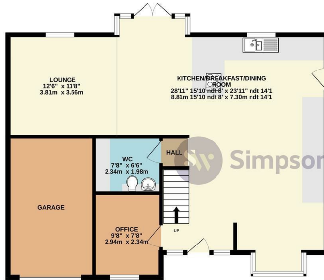
GROUND FLOOR 990 sq.ft. (92.0 sq.m.) approx.