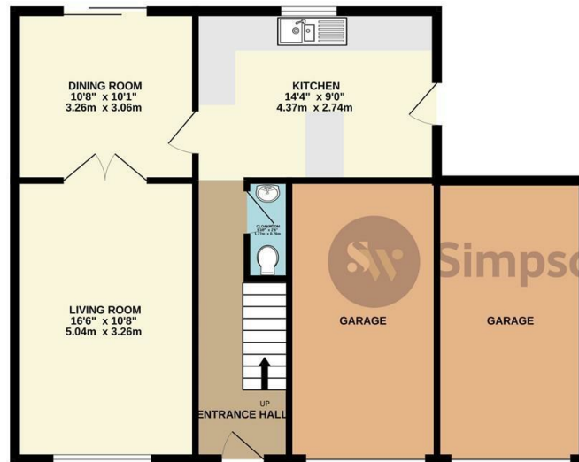
GROUND FLOOR 809 sq.ft. (75.2 sq.m.) approx.