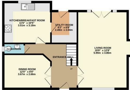
GROUND FLOOR 648 sq.ft. (60.2 sq.m.) approx.