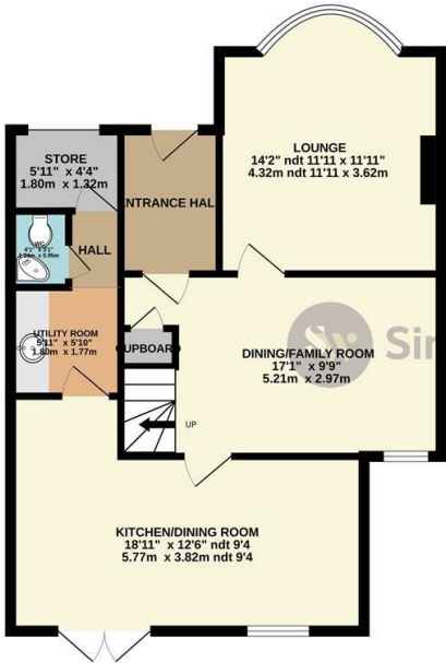
GROUND FLOOR 636 sq.ft. (59.1 sq.m.) approx.