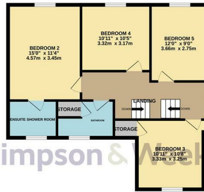
1ST FLOOR 737 sq.ft. (68.5 sq.m.) approx.