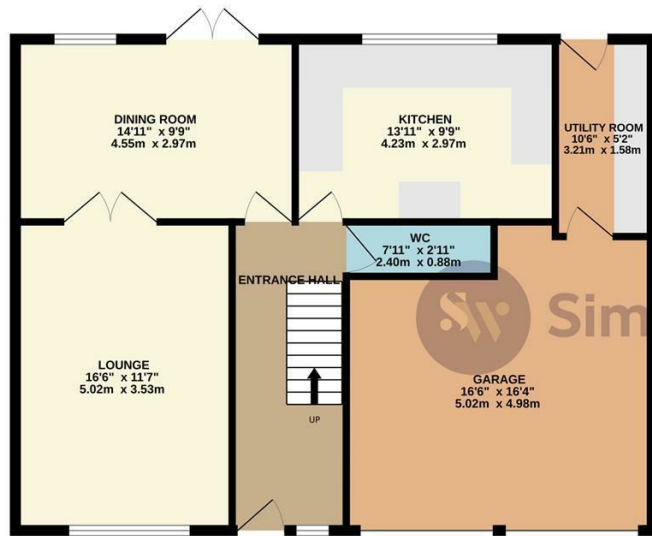
GROUND FLOOR 891 sq.ft. (82.8 sq.m.) approx.