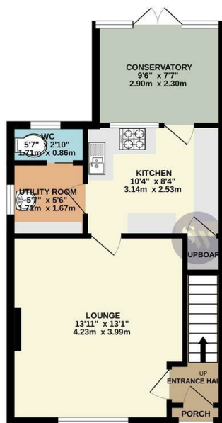
GROUND FLOOR 423 sq.ft. (39.3 sq.m.) approx.