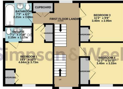
1ST FLOOR 624 sq.ft. (58.0 sq.m.) approx.