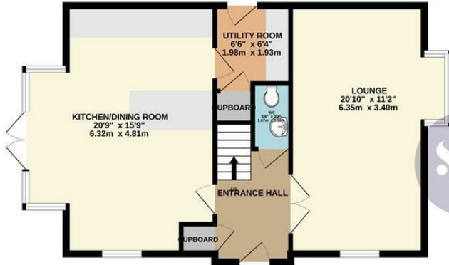
GROUND FLOOR 674 sq.ft. (62.7 sq.m.) approx.