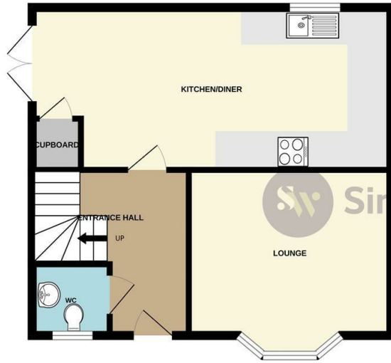
GROUND FLOOR 508 sq.ft. (47.2 sq.m.) approx.