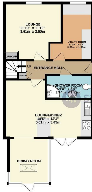
GROUND FLOOR 587 sq.ft. (54.5 sq.m.) approx.