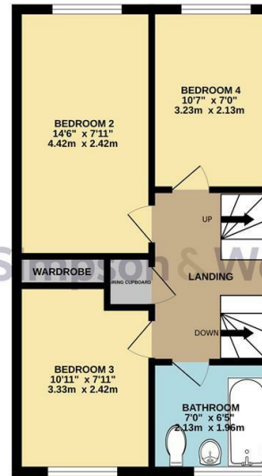
1ST FLOOR 404 sq.ft. (37.6 sq.m.) approx.