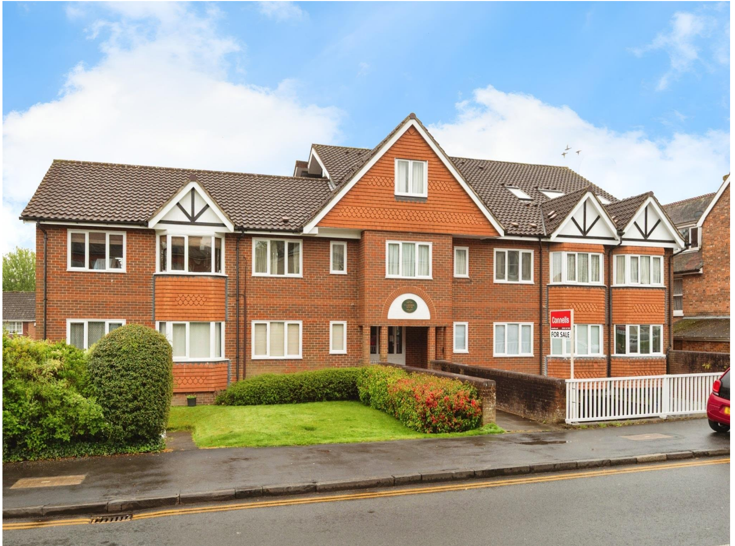
Claridge House Upper Grosvenor Road Tunbridge Wells TN1 2ED

Are you looking for a charming residence situated within the heart of Tunbridge Wells? This stunning first floor one bedroom apartment is simply PERFECT FOR A FIRST-TIME BUYER OR INVESTOR looking to expand their portfolio. See Agent's Note below