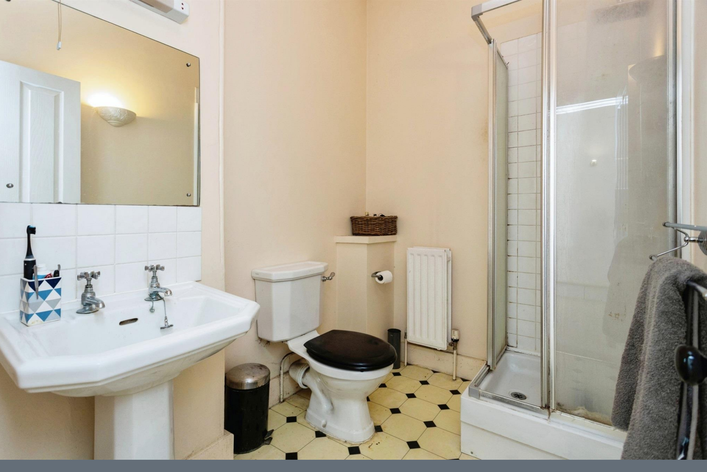
Residential Sales & Lettings | Mortgage Services | Conveyancing | Surveyors | Land & New Homes