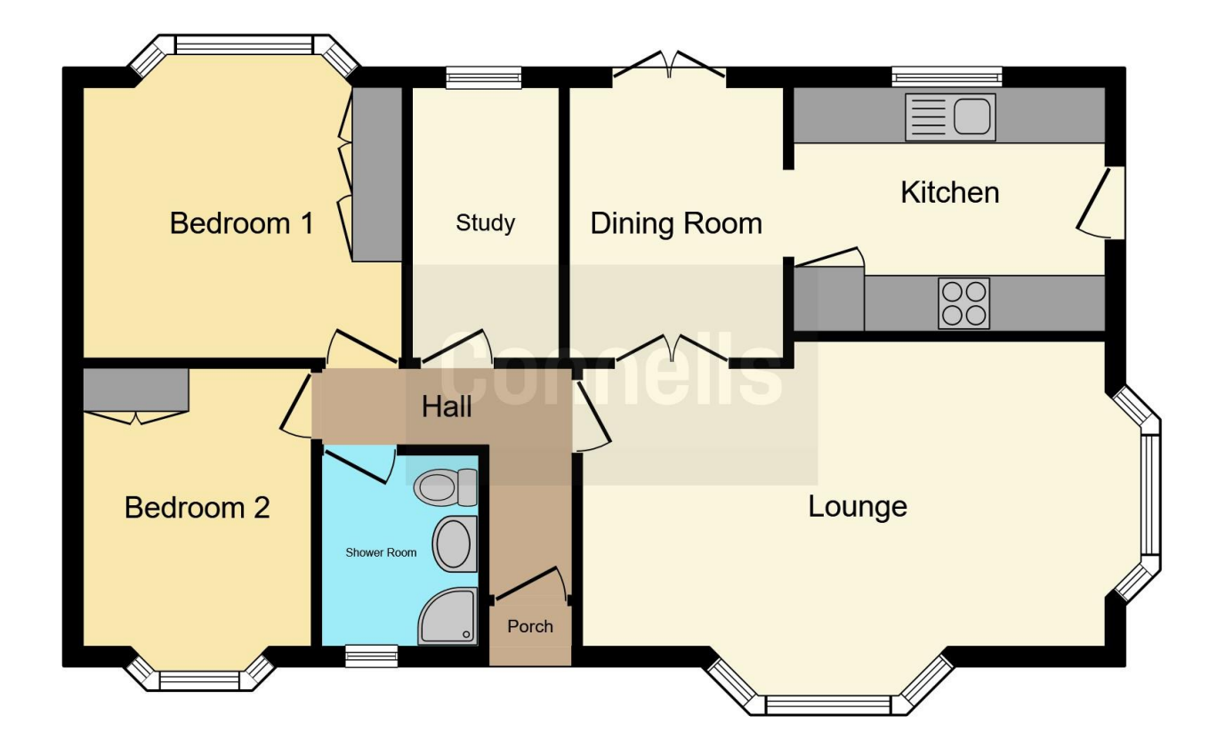
This floor plan is for illustrative purposes only. It is not drawn to scale. Any measurements, floor areas (including any total floor area), openings and orientation are approximate. No details are guaranteed, they cannot be relied upon for any purpose and they do not form part of any agreement. No liability is taken for any error, omission or misstatement. A party must rely upon its own inspection(s). Powered by www.focalagent.com

To view this property please contact Connells on