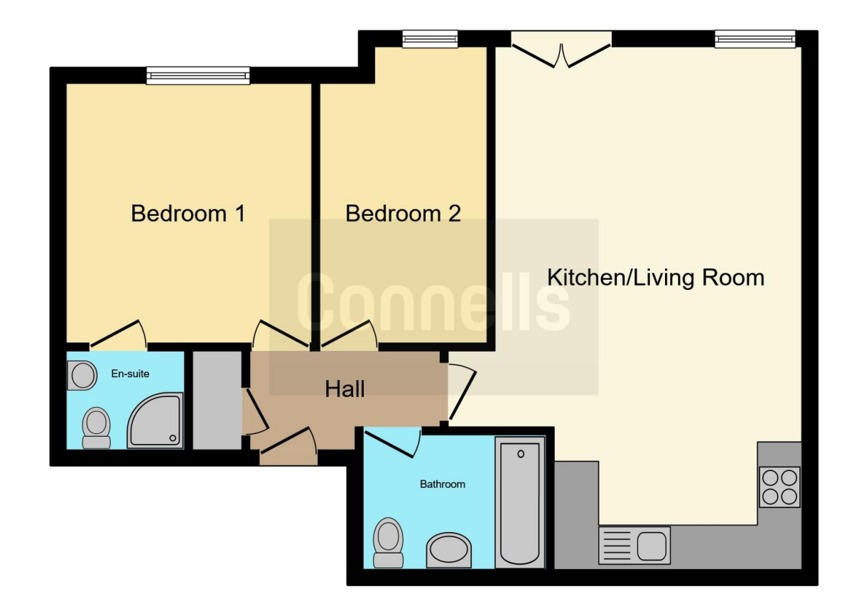
This floorplan is for illustrative purposes only and is not drawn to scale. Measurements, floor-areas, openings and orientations are approximate. They should not be relied upon for any purpose and do not form any part of an agreement. No liability is taken for any error or mis-statement. All parties must rely on their own inspections.

To view this property please contact Connells on