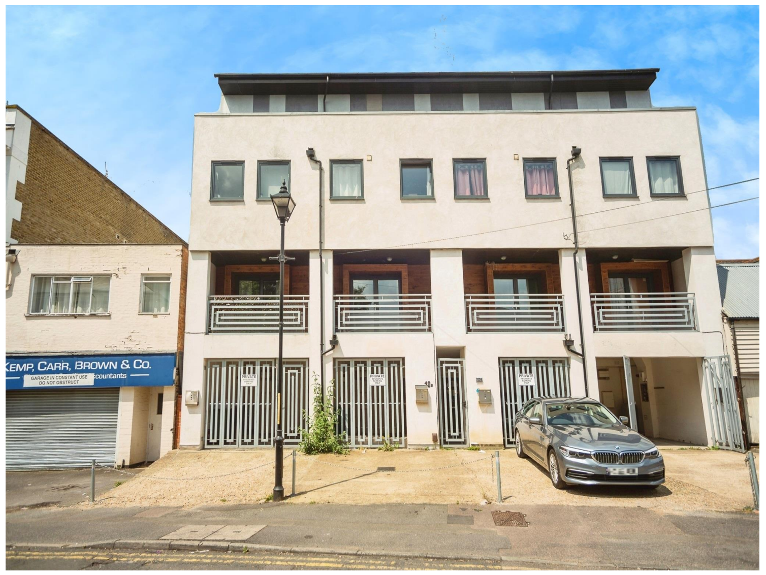
Norwood Street Ashford TN23 1QU

Three Bedroom Townhouse - Large Rooms - Kitchen/Diner - Balcony off Lounge, Bedroom Three and Landing, Driveway - Close to Town Centre and Train Station - Built in 2017 - No Onward Chain