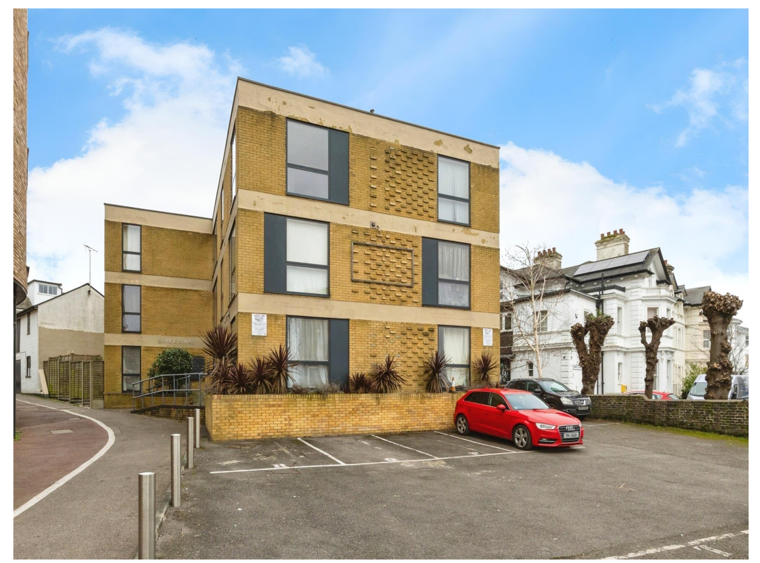
Elwick House Elwick Road Ashford TN23 1AU

Connells are excited to bring this conveniently located one bedroom flat to the market, positioned right in the heart of Ashford Town Centre. An ideal investment or first purchase, with a long lease, call sole agents Connells for your chance to view now!