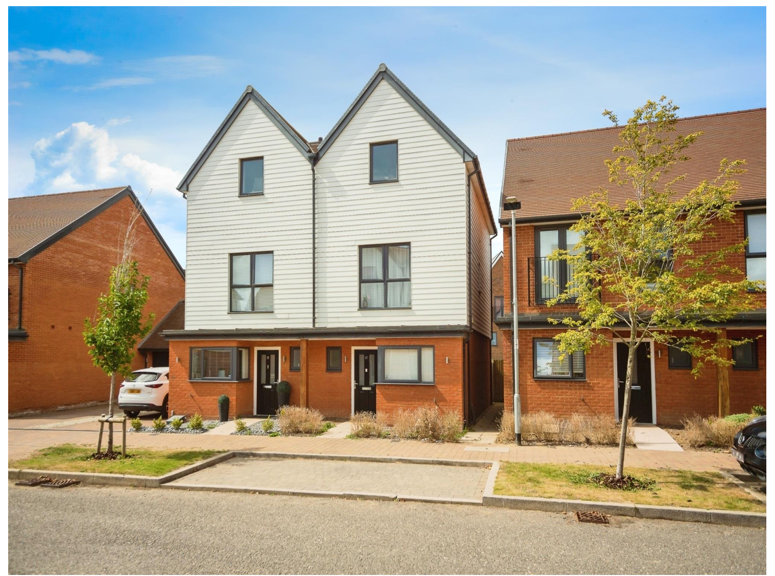
Woodland Rise Chilmington Green Ashford TN23 8AR

We are delighted to offer to the market this fantastic three bedroom family home on the popular Chilmington development. Being offered to market with no forward chain, means you could be in sooner than you think.