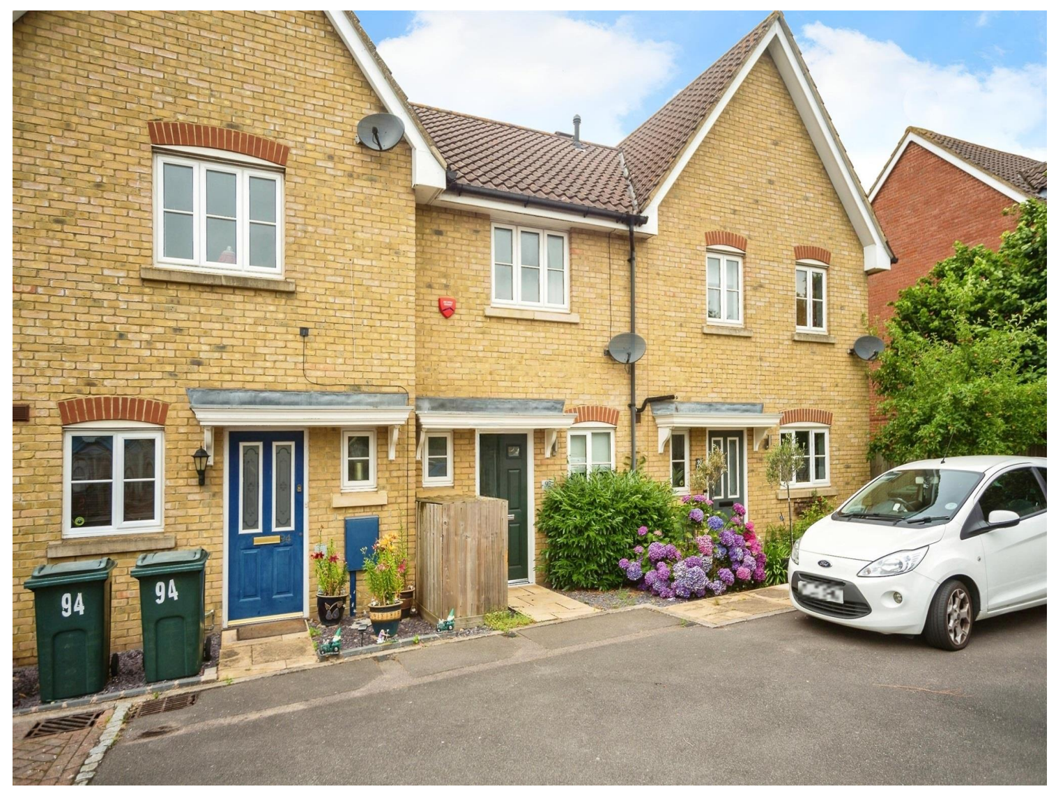
Guernsey Way Kennington Ashford TN24 9LW

"A WELL-PRESENTED TWO BEDROOM HOUSE POSITIONED IN THE POPULAR AREA OF KENNINGTON"