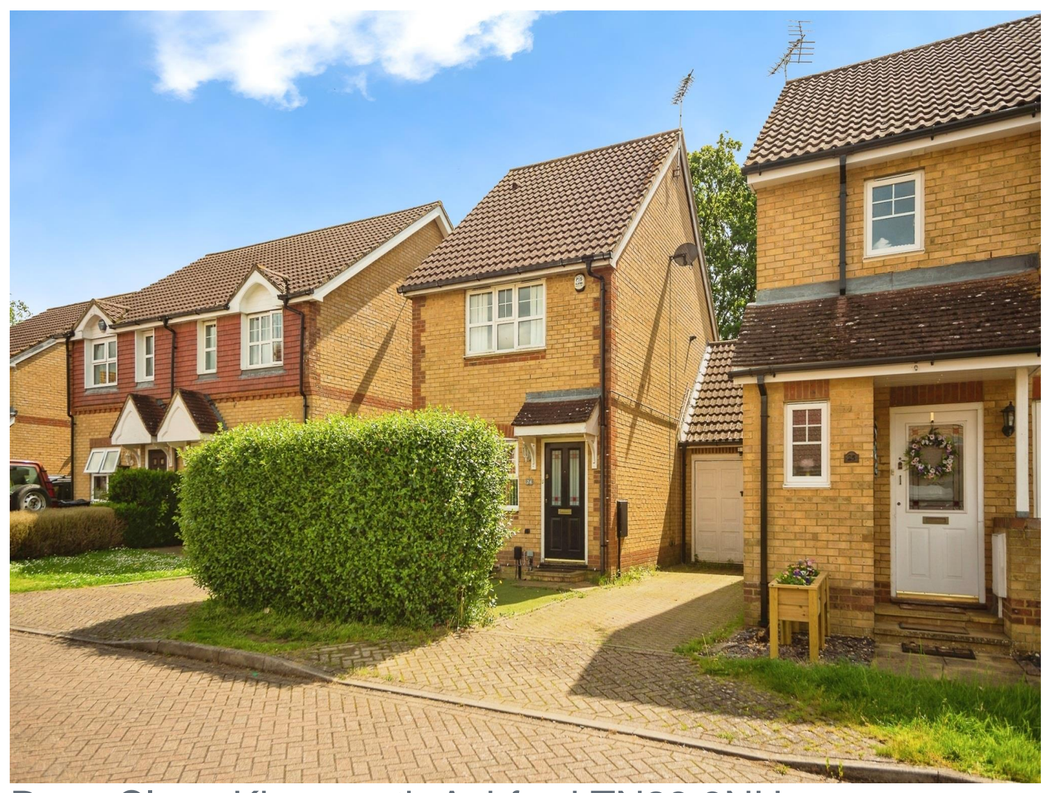
Dove Close Kingsnorth Ashford TN23 3NU

Connells are pleased to offer to the market this stunning two bedroom link detached family home. This beautiful property is located within the popular residential location of Dove Close, Kingsnorth, Ashford. For your chance to view, please call sole agent Connells now.