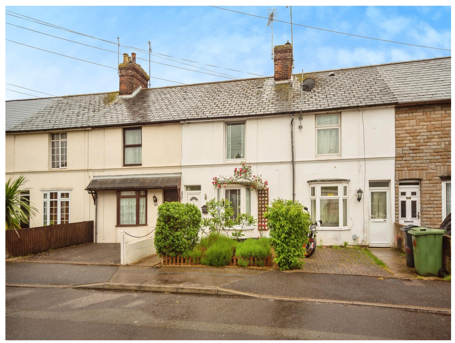
Albemarle Road Willesborough Ashford TN24 0HN

Connells are delighted to offer to the market this beautiful two bedroom mid-terraced house. This home is located within Albemarle Road, Ashford, Kent. This property is an ideal first time buy / investment opportunity.