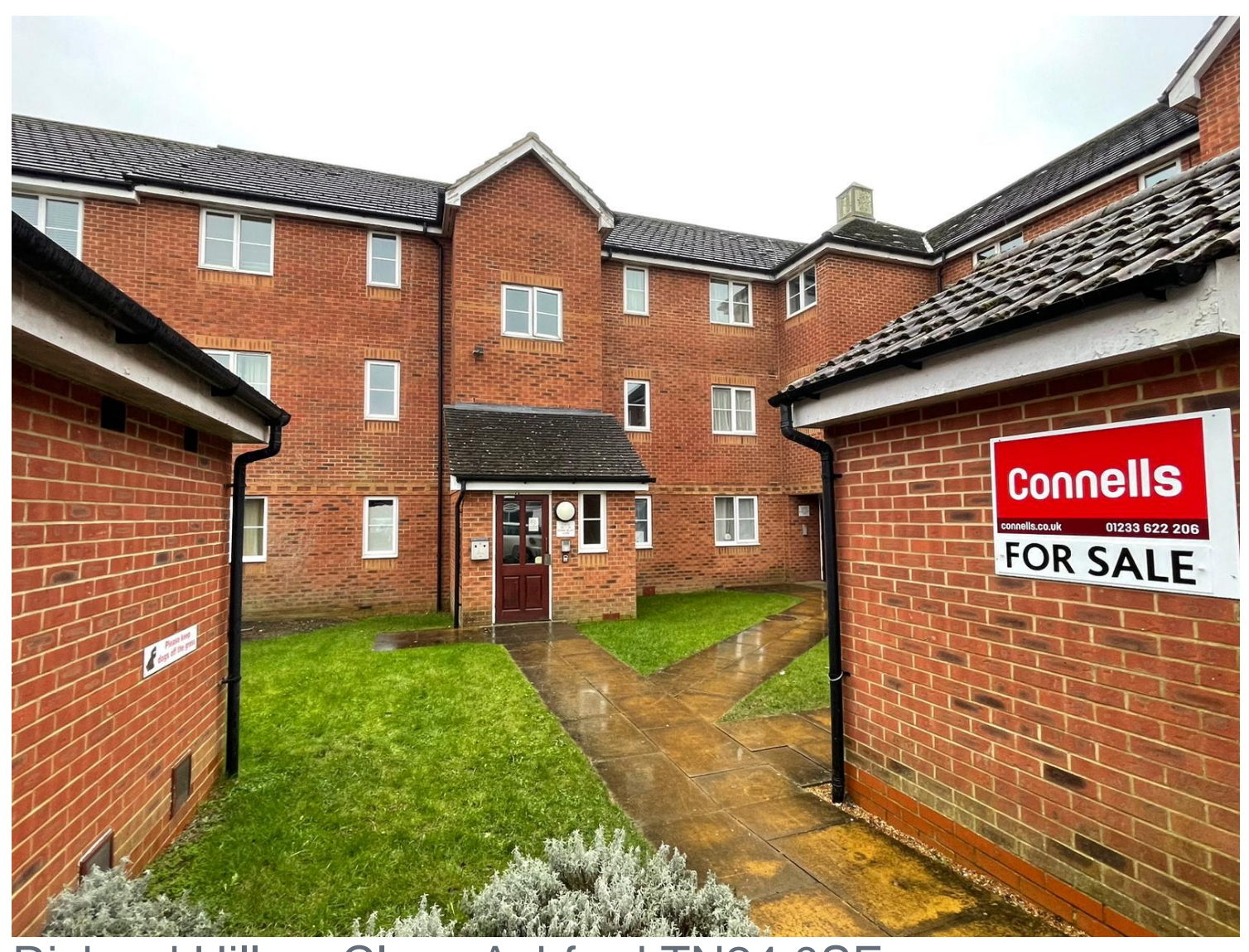
Richard Hillary Close Ashford TN24 0SF

Connells are delighted to offer to the market this spacious two bedroom second floor apartment. The property is situated within the popular residential location of Richard Hillary Close, Ashford. For your chance to view, please call sole agent Connells on 01233 622206 to book your viewing now!