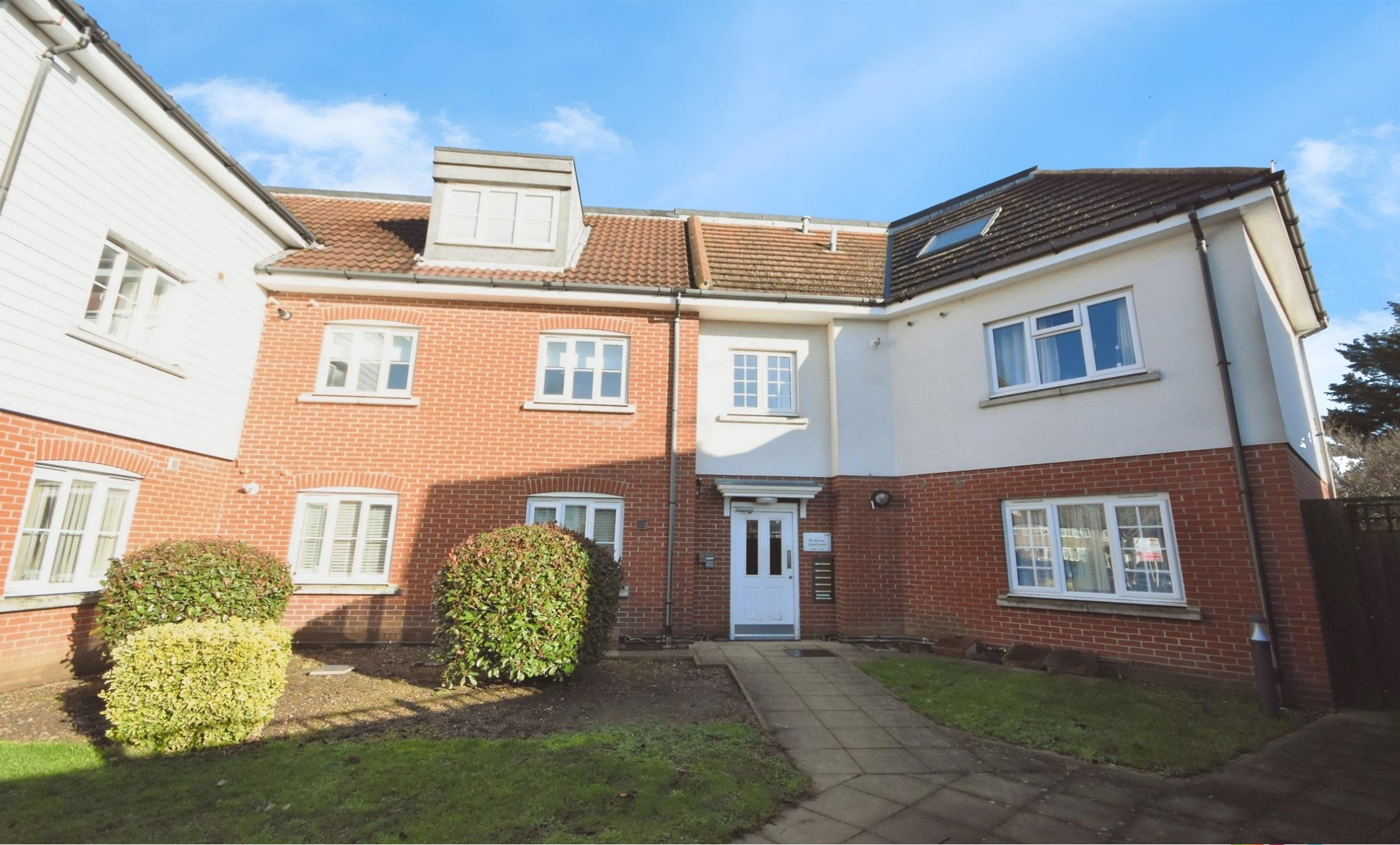
Pemberley Apartments, Gillian Crescent, Romford, RM2 6NU