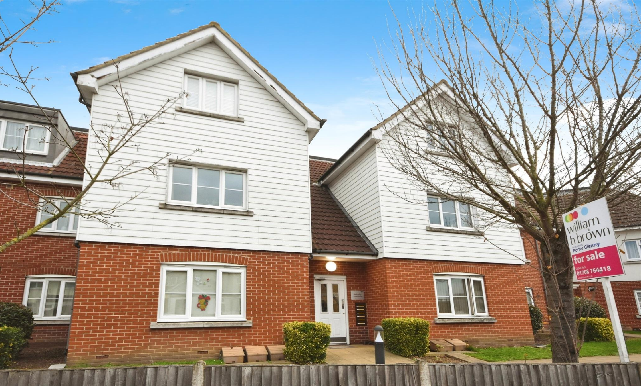
Pemberley Apartments, Gillian Crescent, Romford, RM2 6NU