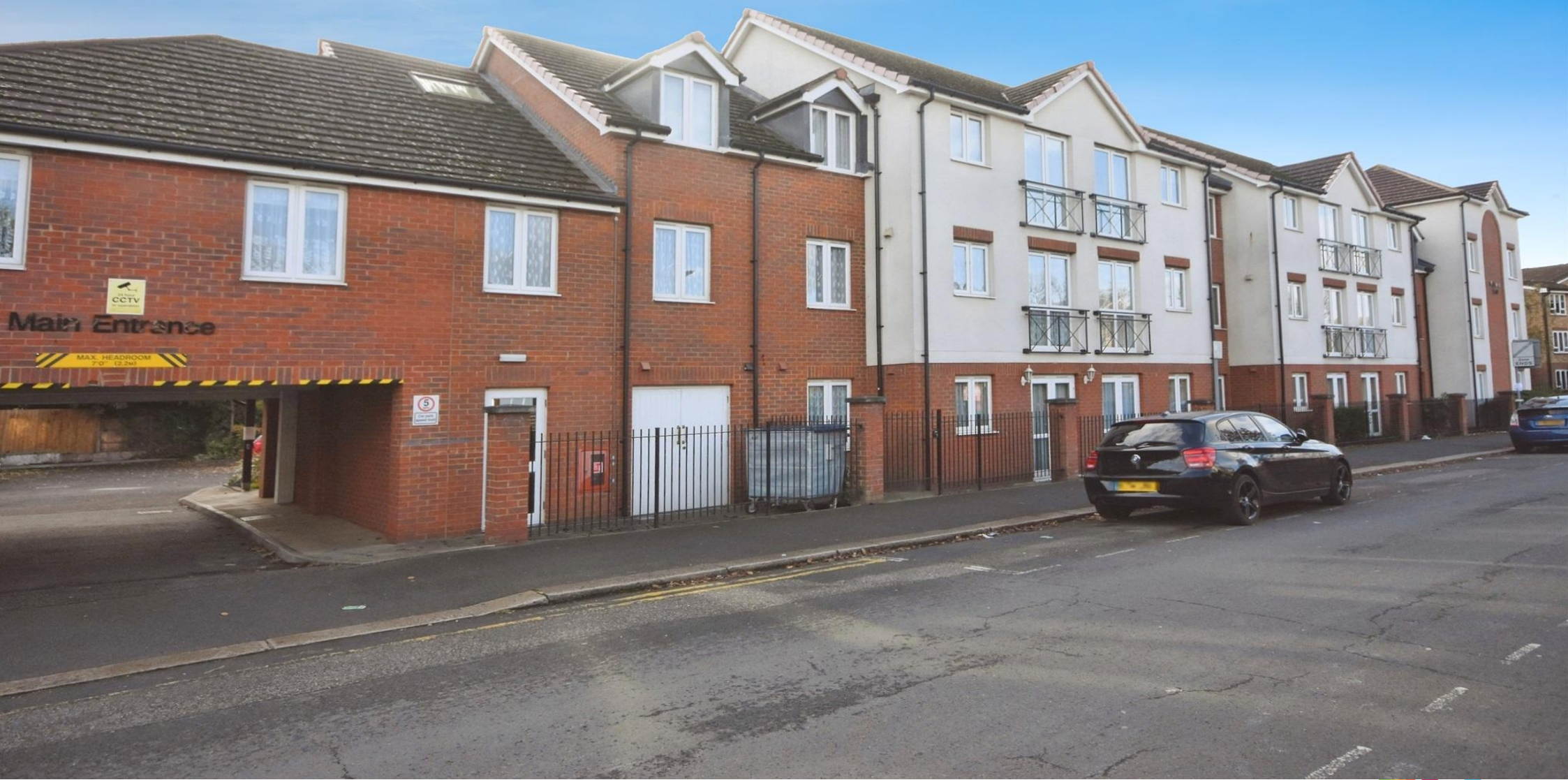
Myddleton Court, Clydesdale Road, Hornchurch, RM11 1GL