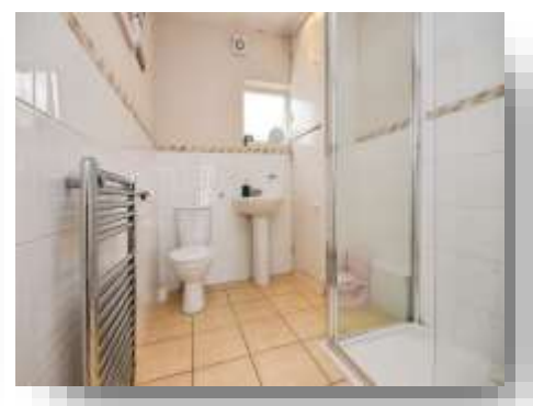
Belds we have Stafford Ave Stafford Ave