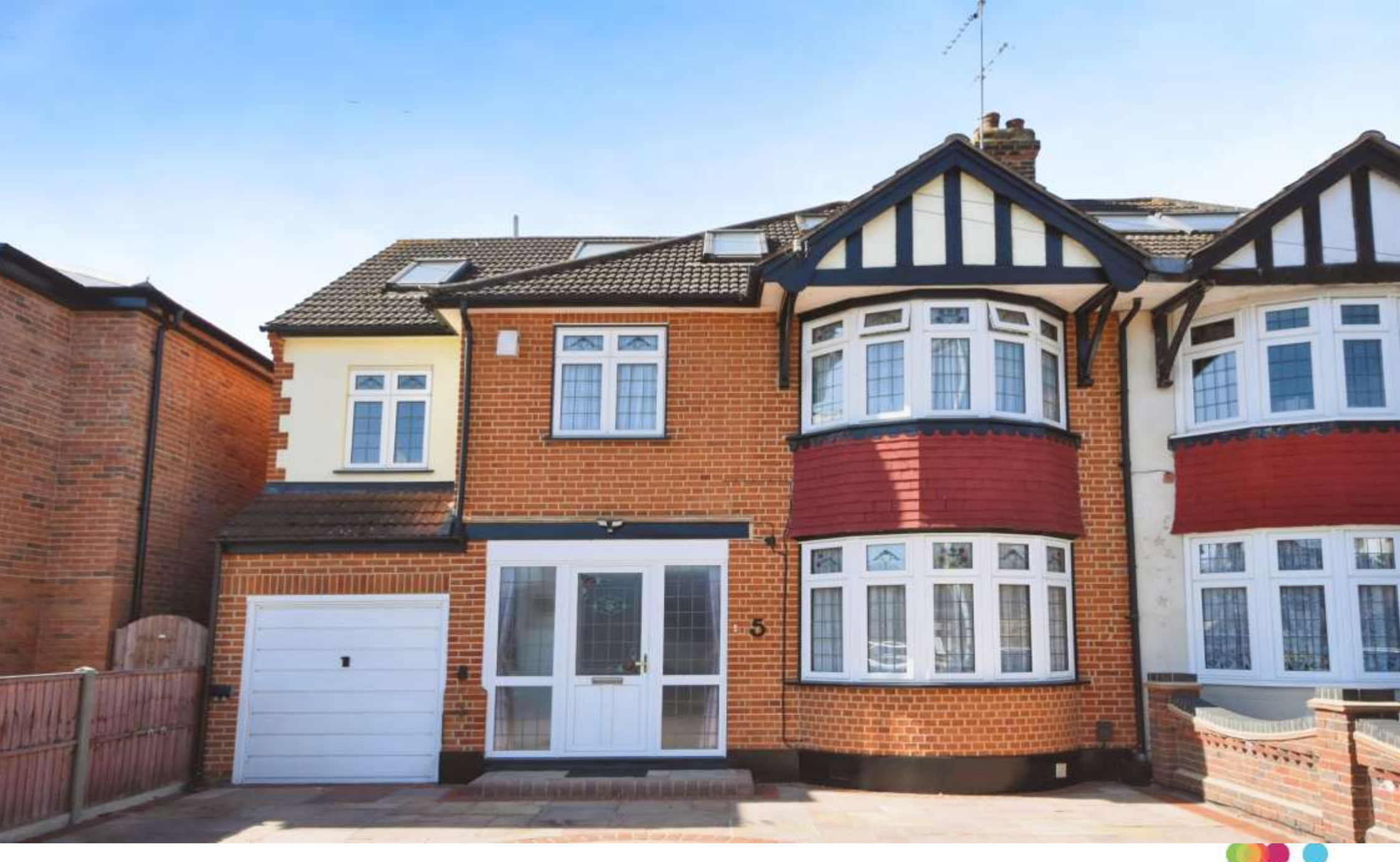
Pettits Lane, Romford, RM1 4HL