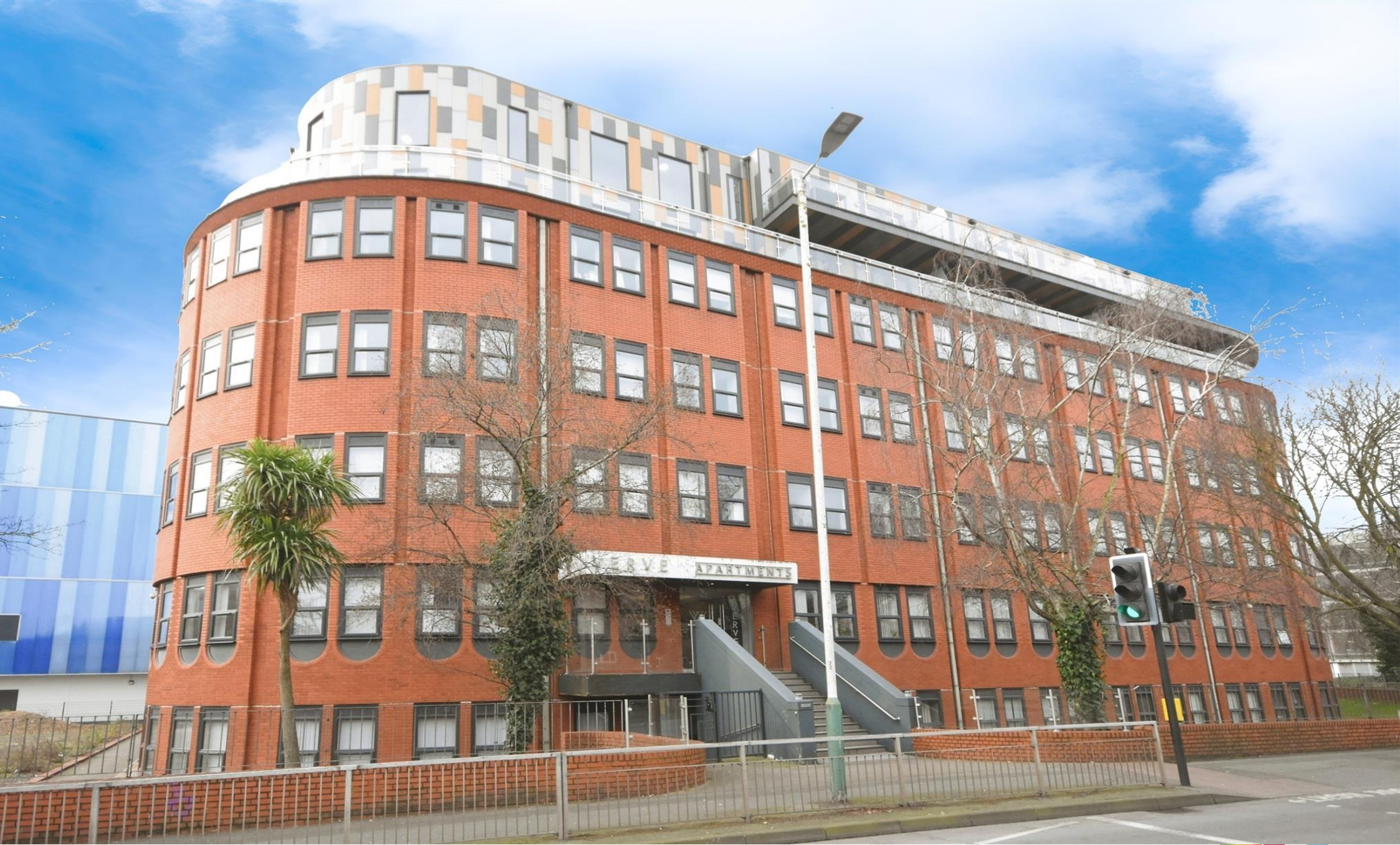
Verve Apartments, Mercury Gardens, Romford, RM1 3FD