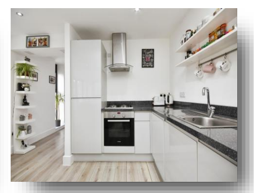
Redignate Ave Redignate Ave Redignate Ave