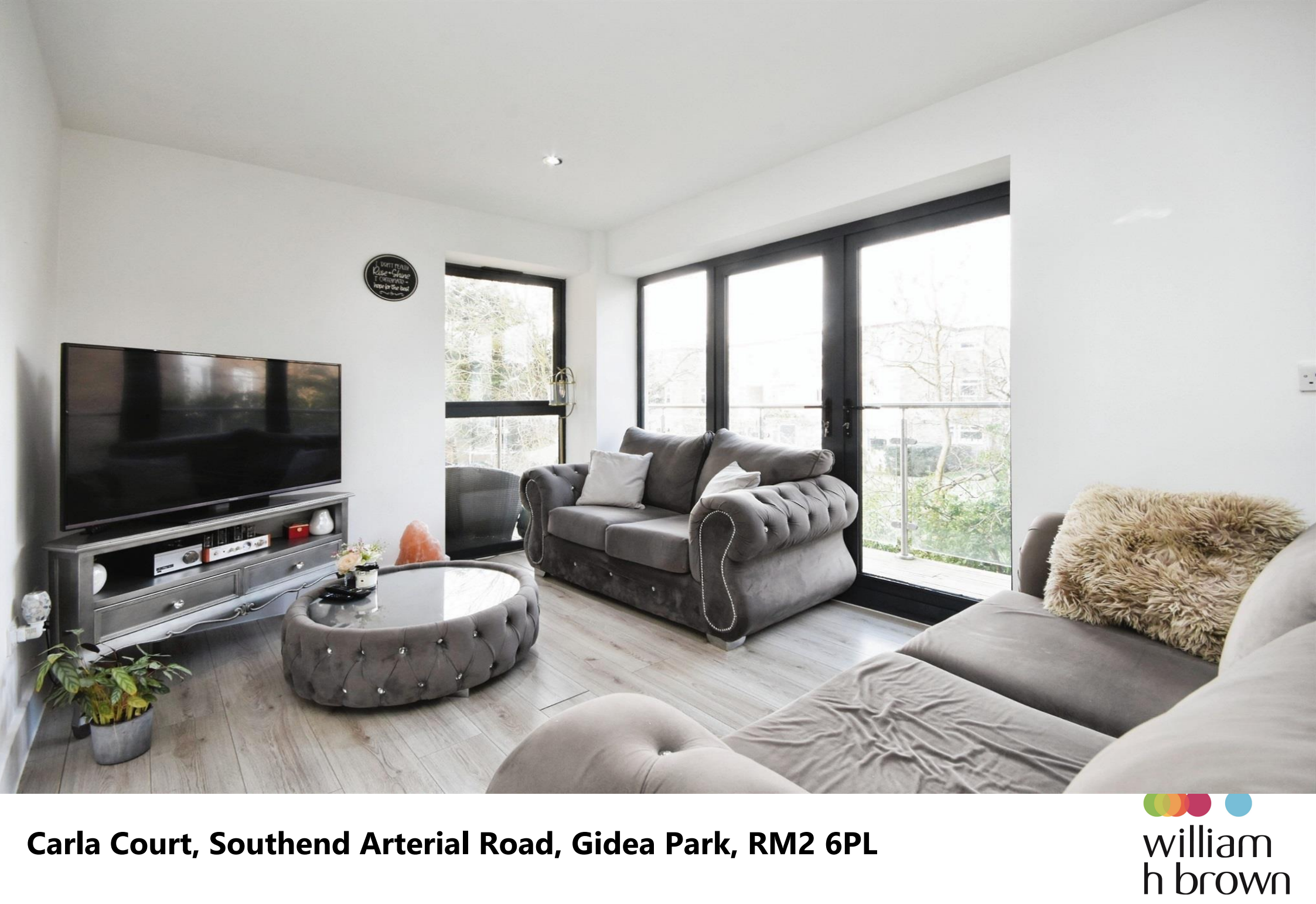
Carla Court, Southend Arterial Road, Gidea Park, RM2 6PL