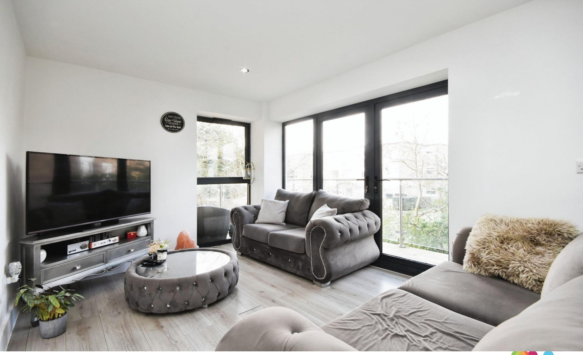
Carla Court Southend Arterial Road, ROMFORD RM2 6PL