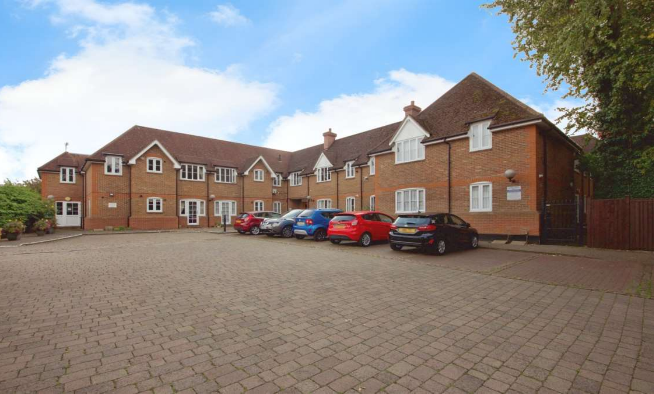
Gidea Lodge, Main Road, Romford, RM2 5HR