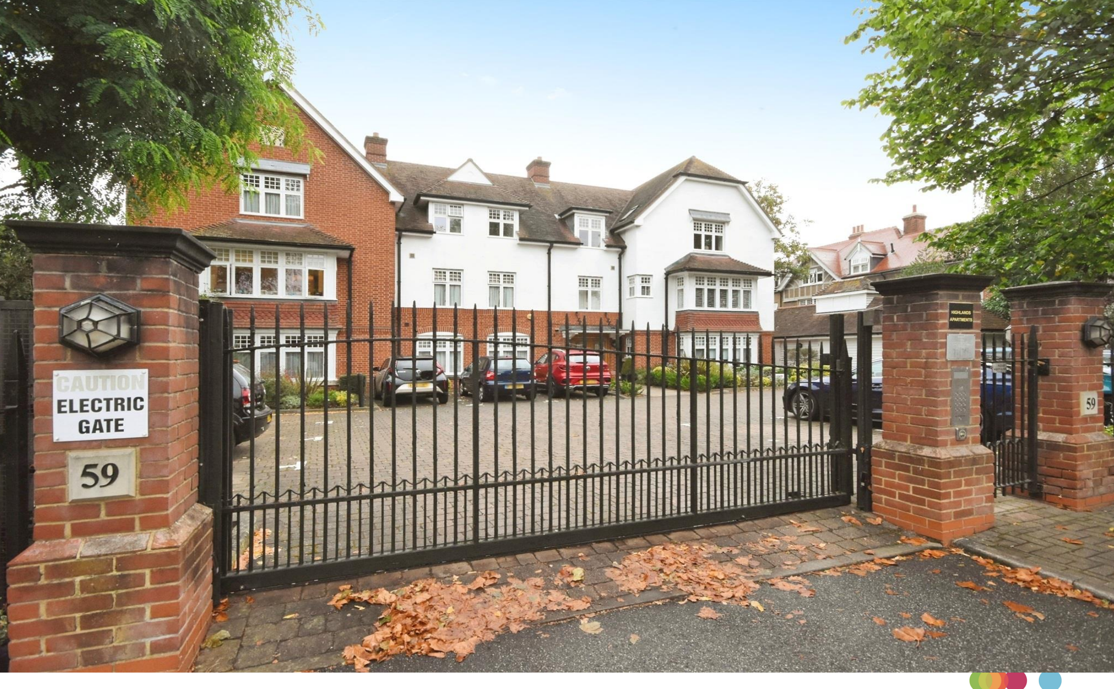
Highlands Apartments, Main Road, Gidea Park, Romford, RM2 5EH