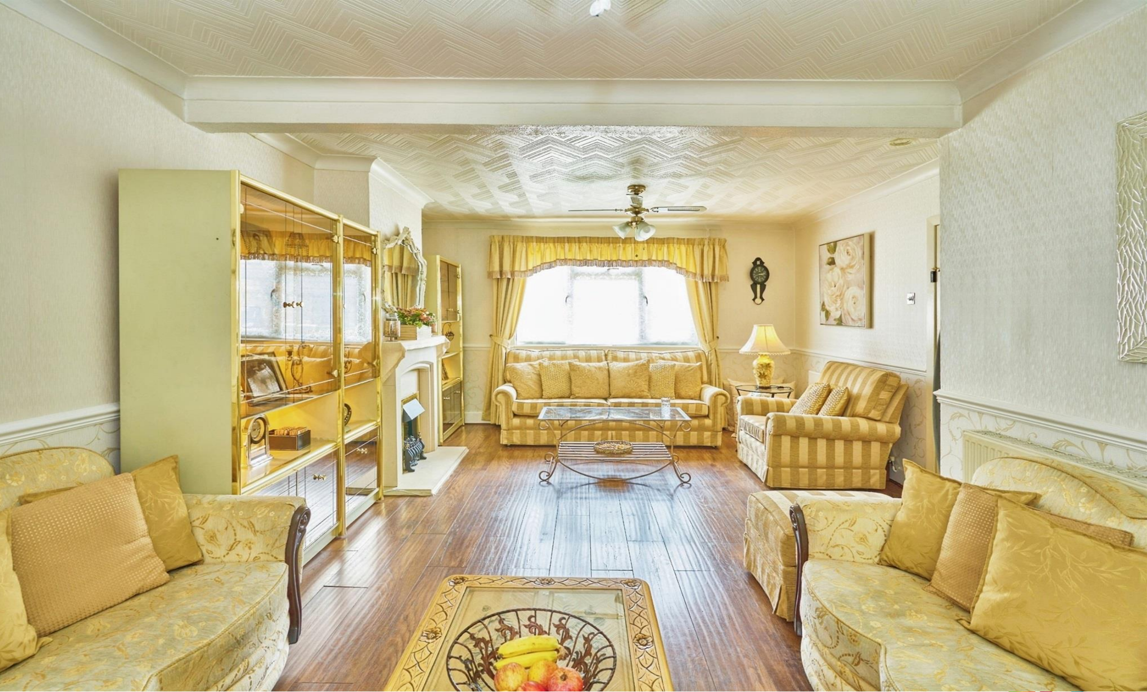
Dunster Close, Collier Row Romford RM5 3AT