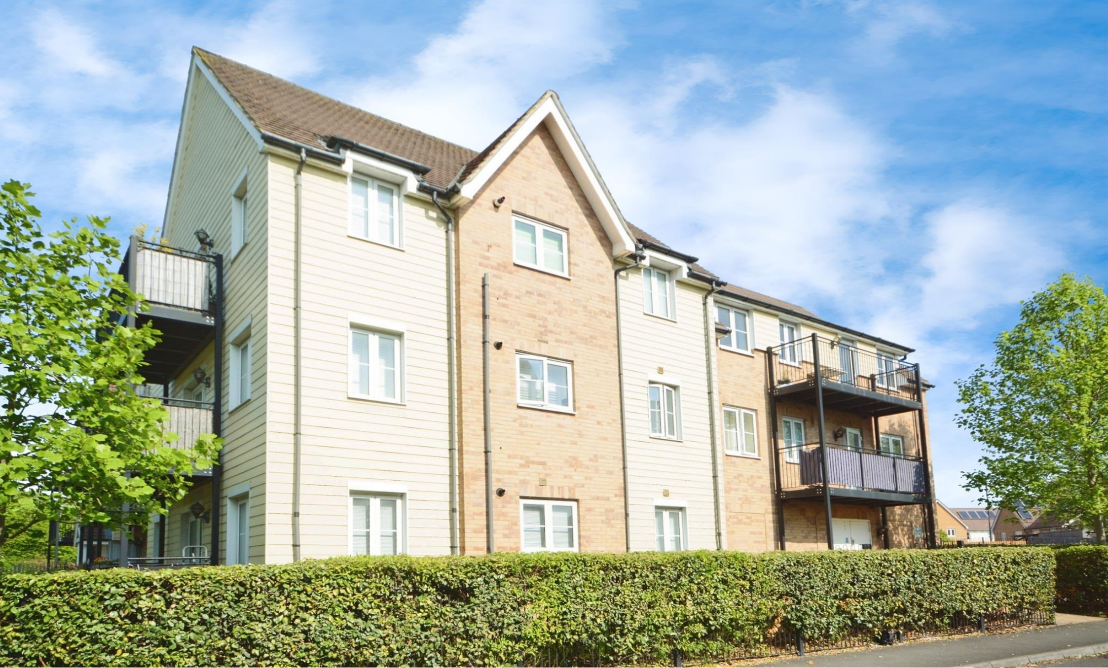
Albermarle House Bernwelle Avenue, Romford RM3 9FA