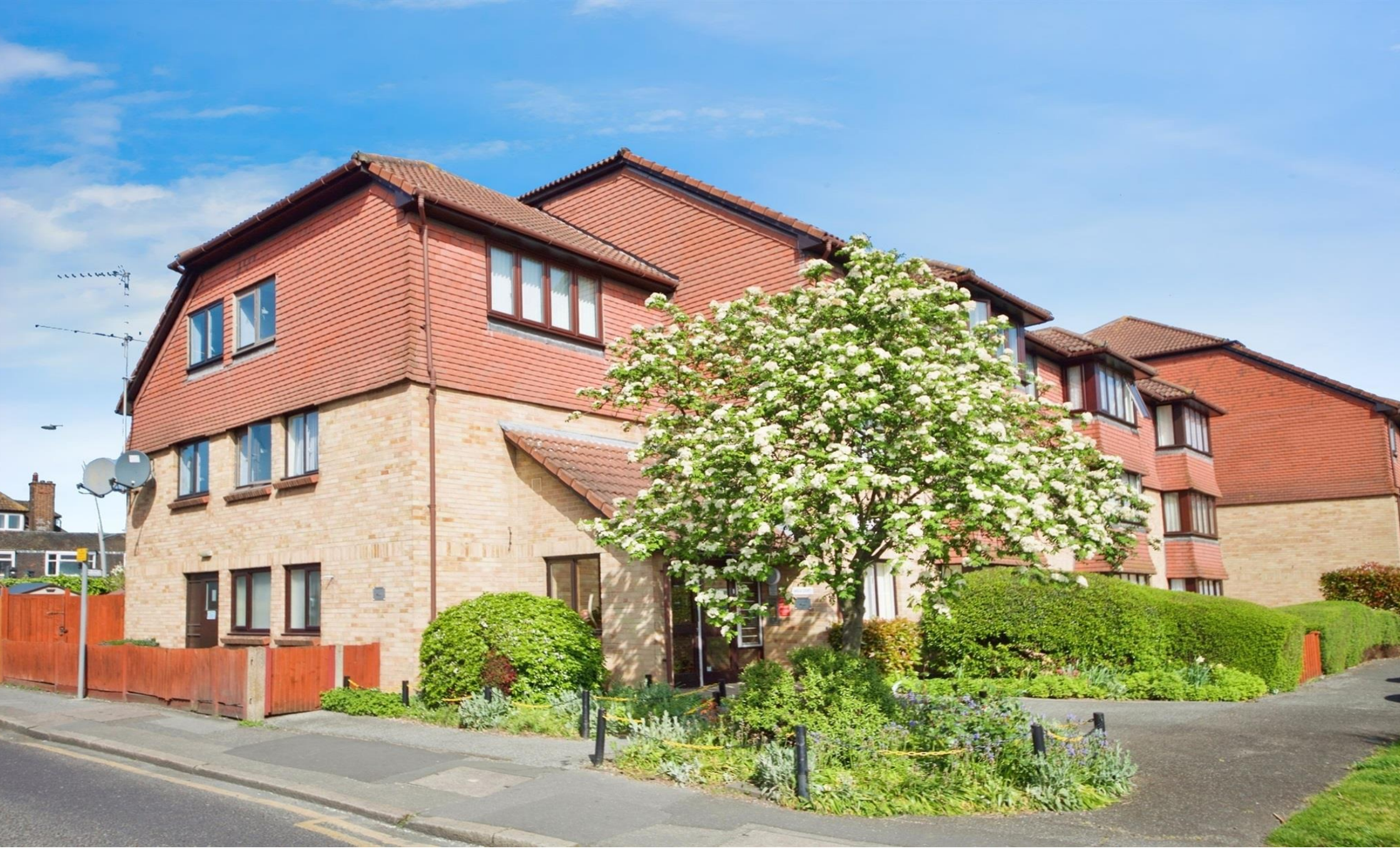
Anglia Court, Spring Close, Dagenham, RM8 1SW