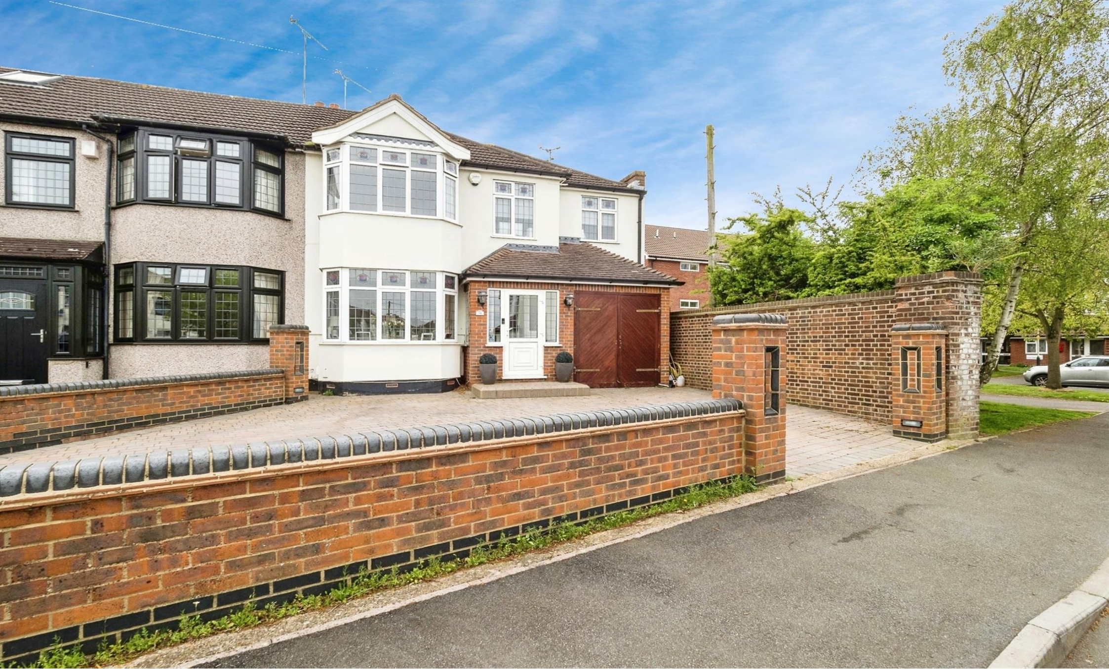
Amery Gardens, Gidea Park, RM2 6RU