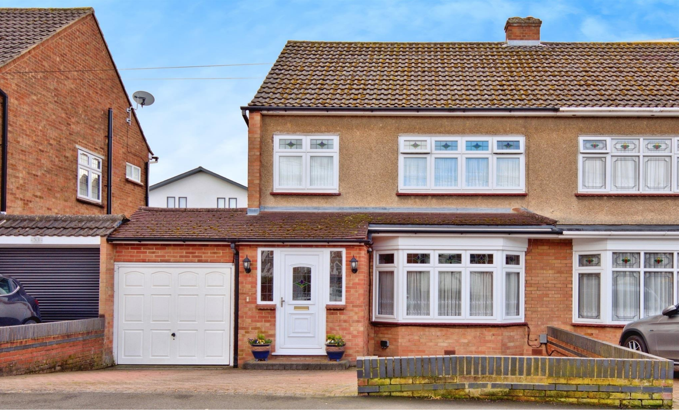
The Drive, Harold Wood, Romford, RM3 0DX