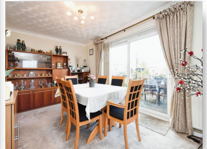
Amery Gardens, Romford RM2 6RS