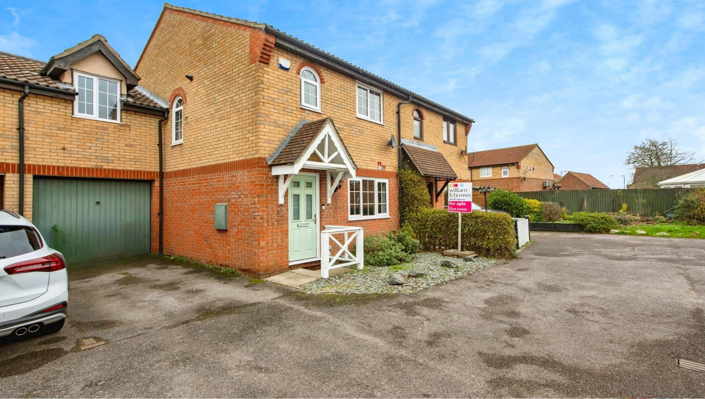
Lavender Close, South Ockendon RM15 6TH