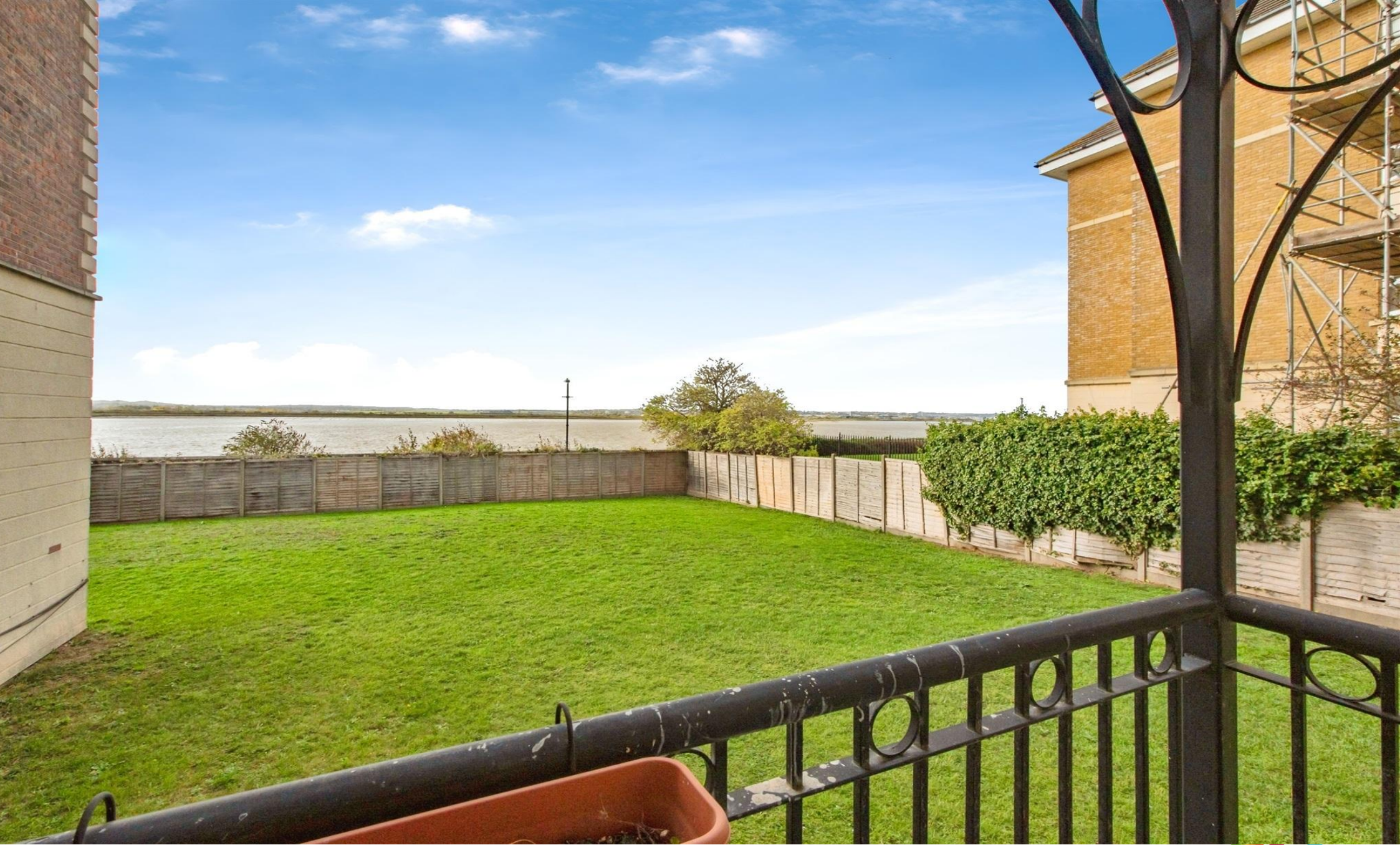
Harrisons Wharf, Purfleet-On-Thames RM19 1QW