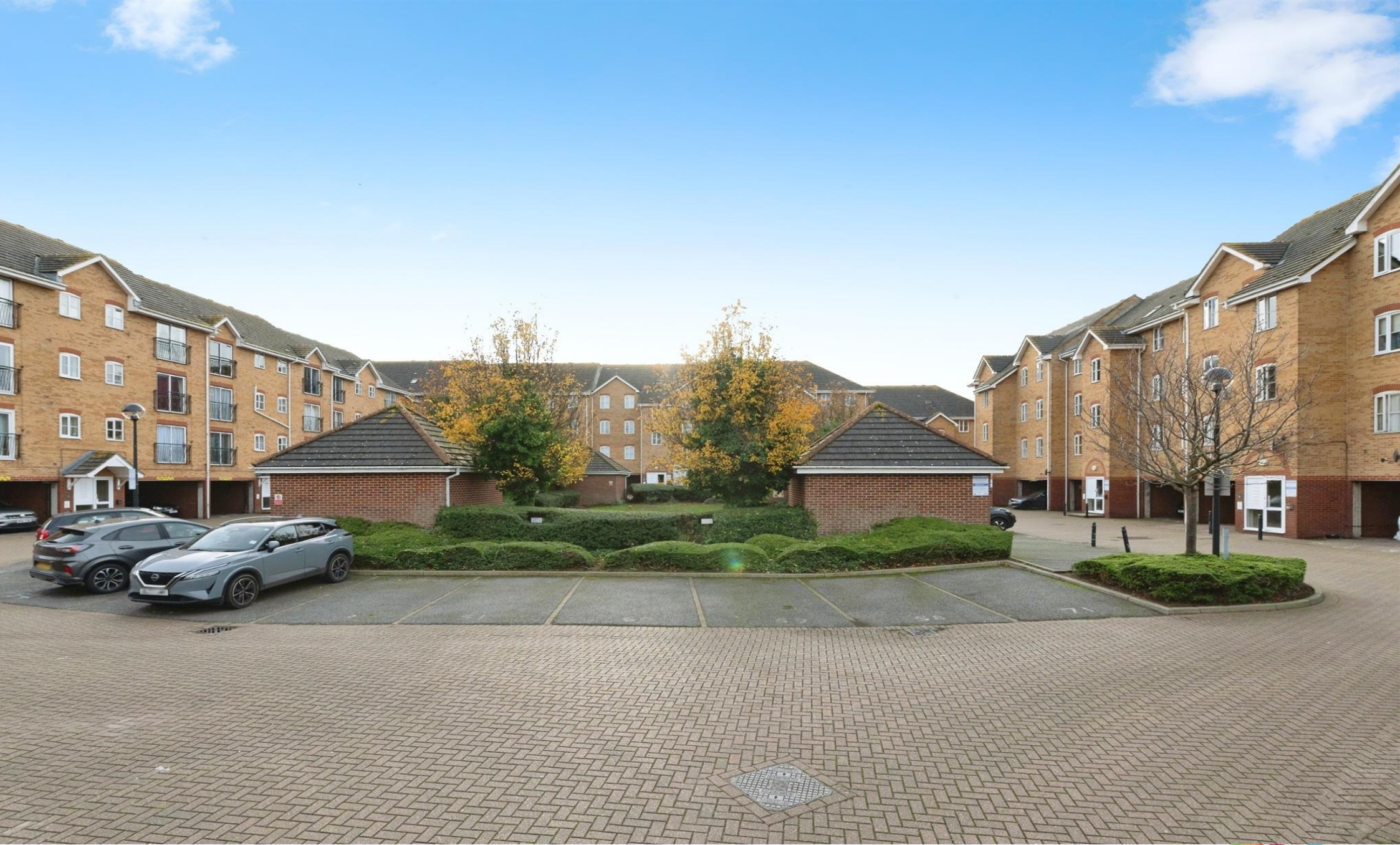
Timber Court, Grays RM17 6PW