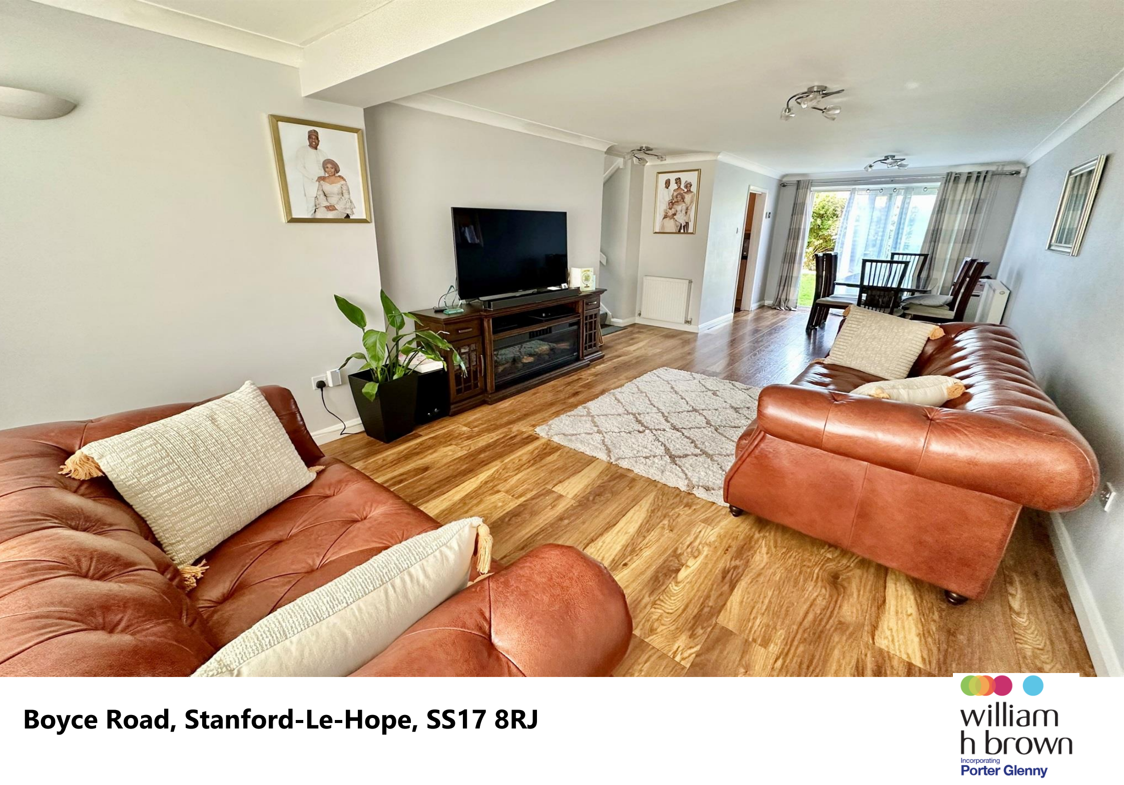
Boyce Road, Stanford-Le-Hope, SS17 8RJ