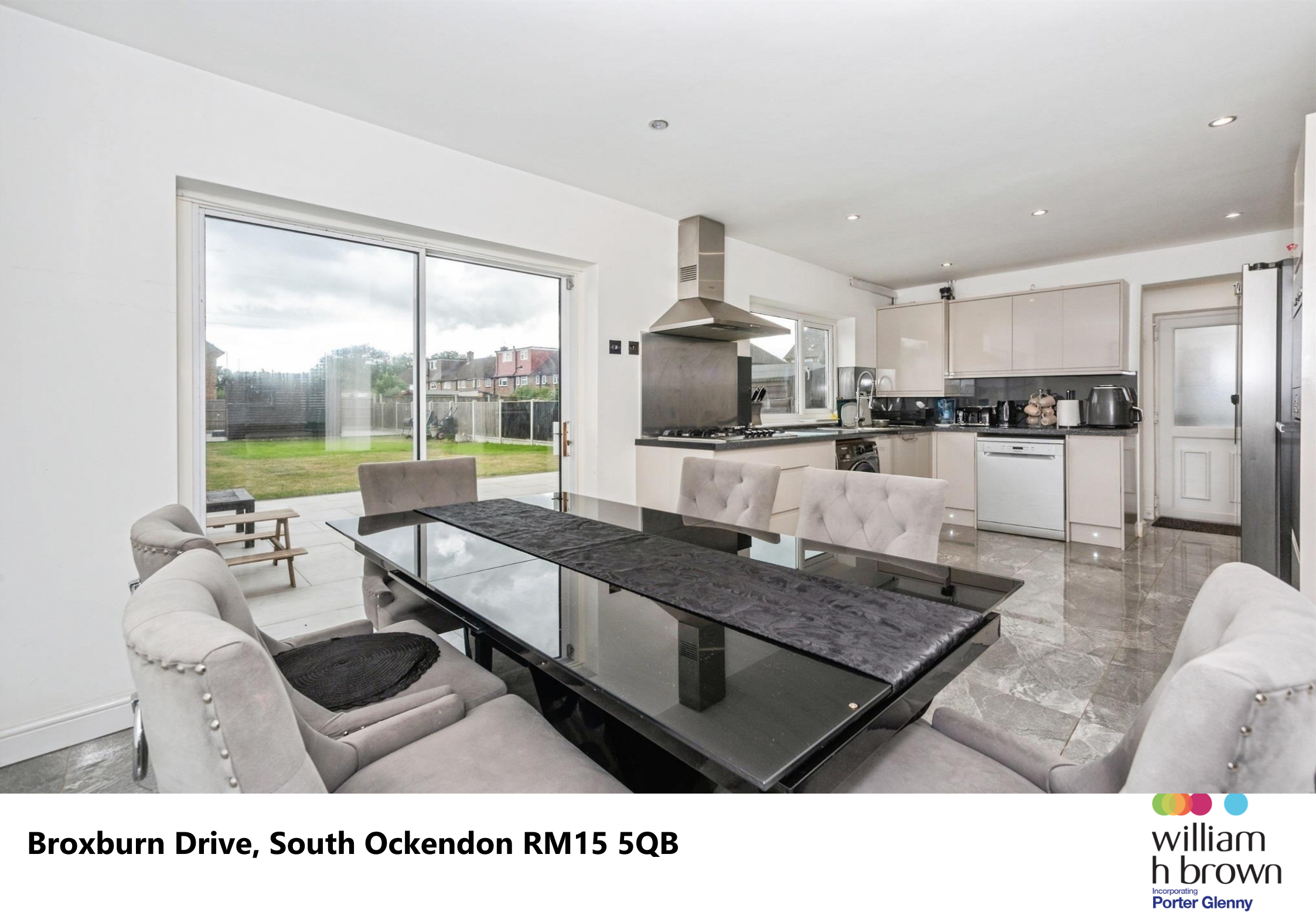
Broxburn Drive, South Ockendon RM15 5QB