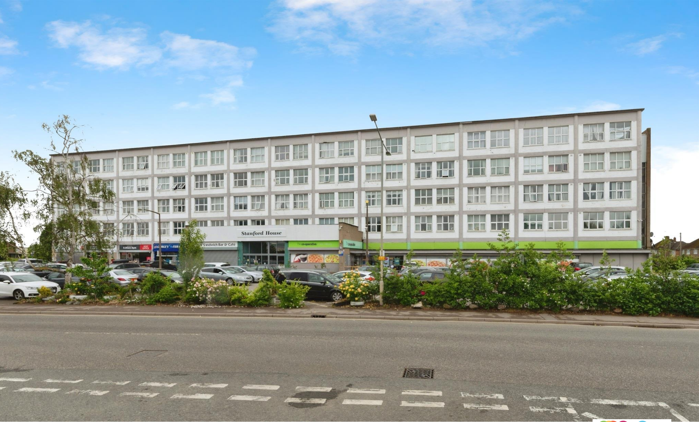
Stanford House, Princess Margaret, Road, East Tilbury Tilbury RM18 8YR