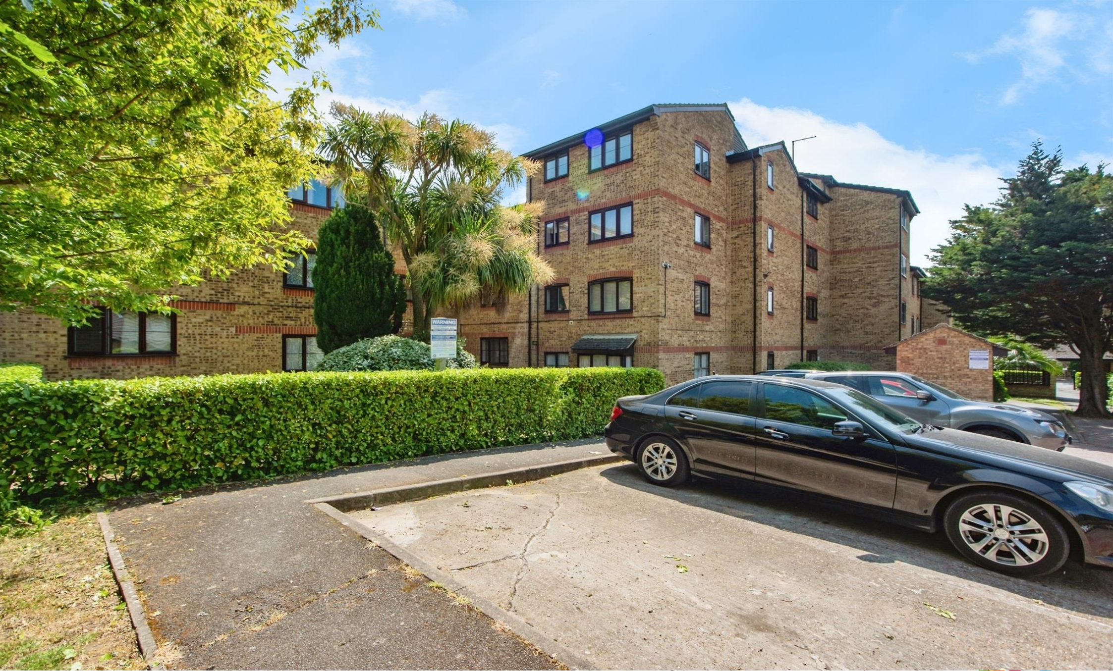
Wyvern House, Bridge Road, Grays RM17 6RS