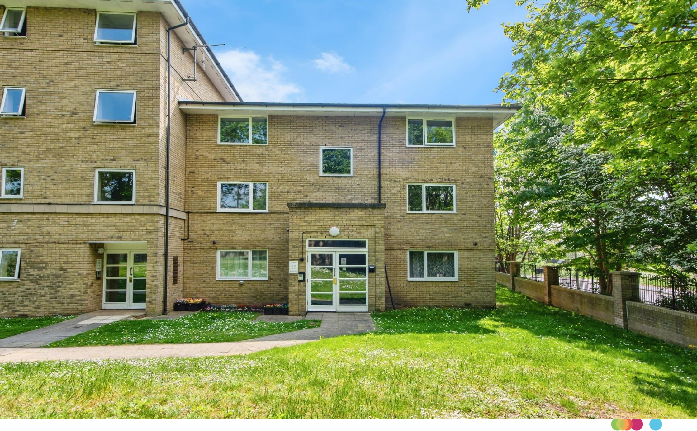
Kingfisher Heights, Hogg Lane, Grays RM17 5QQ