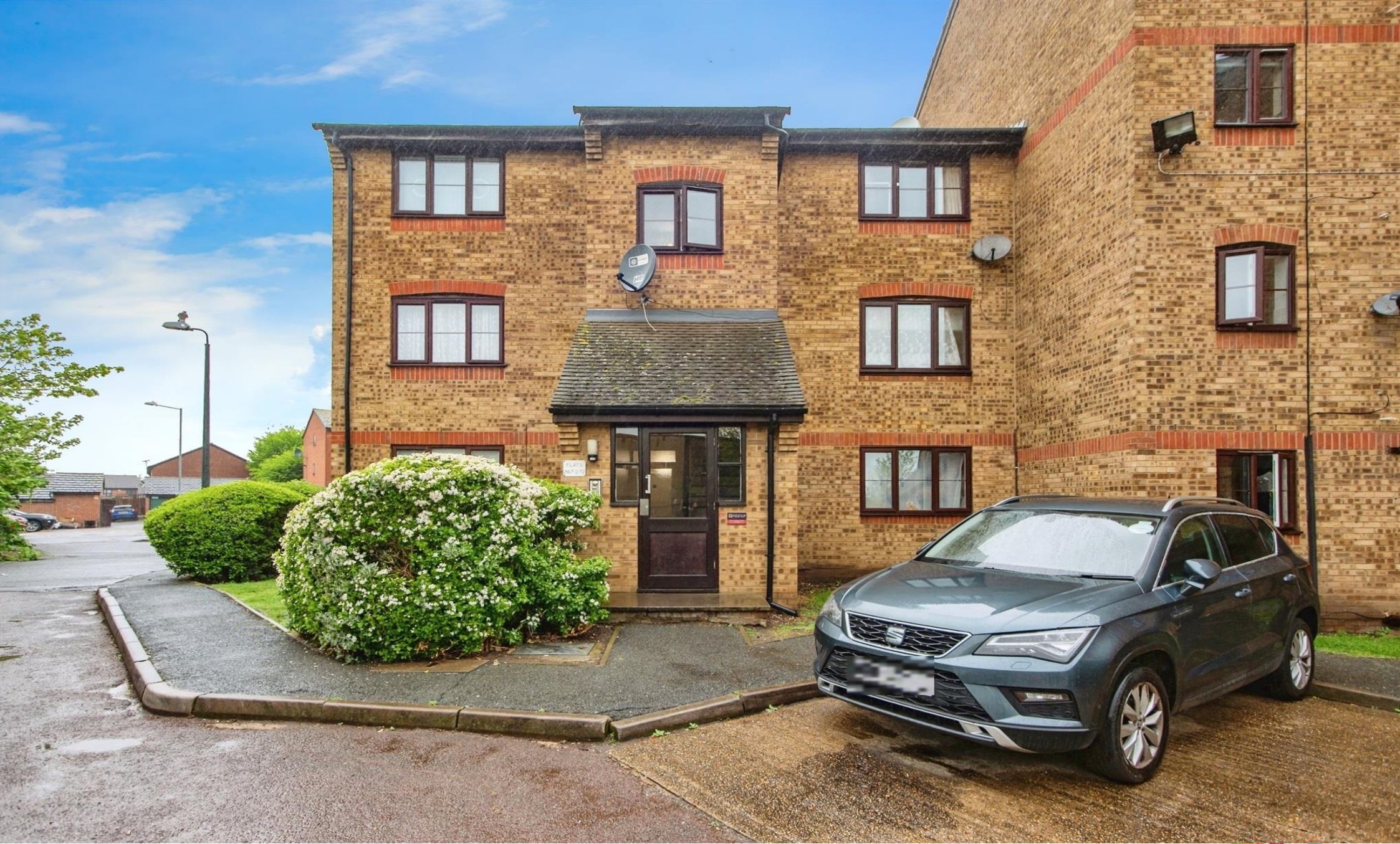
Russet House, Falcon Avenue, Grays RM17 6SF