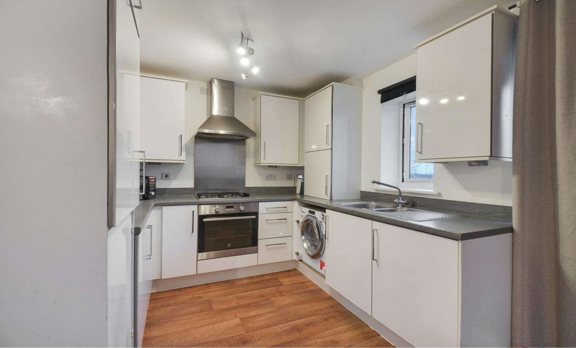
Cooper House, Woodside Close, Grays RM16 2ES